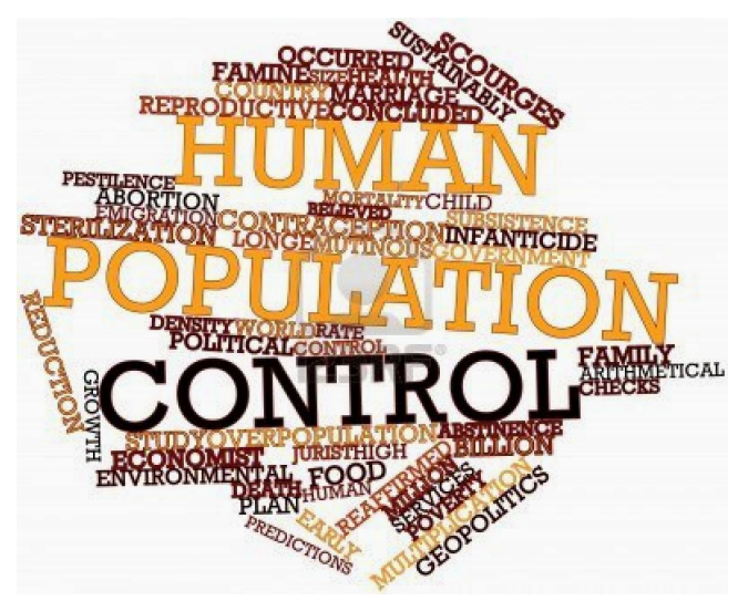
"When a girl in the developing world receives seven years of education, she marries four years later and has 2.2 fewer children."

However, there ARE certain things we can see which remove any doubt that "they" fully understand what they are doing. Look at this claim from the Canadian NGO called C.A.R.E. which is designed to help women in developing nations: