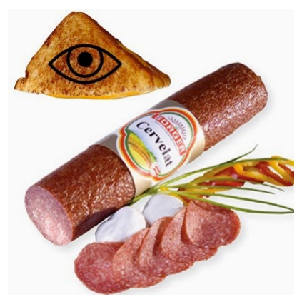
The Cervelati (33rd Order of the Salami)

I can see two reactions amongst my readers as I say this. The first is going, "Well thank, goodness! I was wondering if he had the balls to bring that subject up."