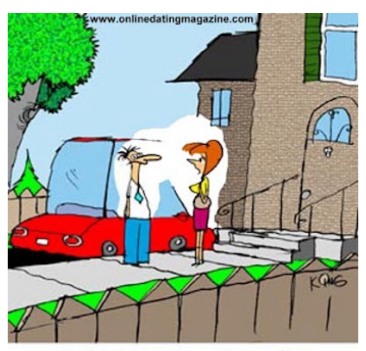
"Let's go back to meeting on-line. You're much better looking there."

The Masculine Principle | 10 March, 2015 | by .