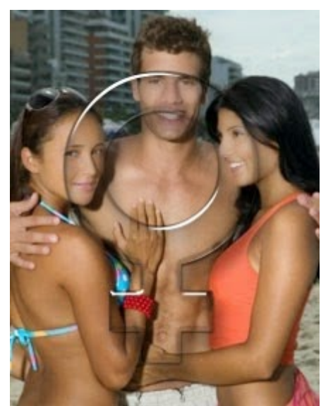
Click for "The Suffragettes versus The Truth"