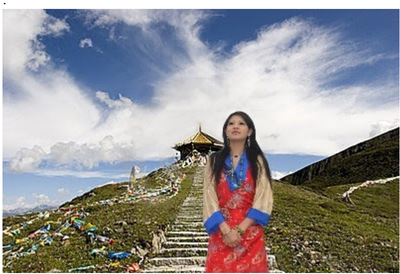
Click Pic for "Generalizing in a Politically Correct World"

"Meanwhile, as long as there's still one honest woman living at the temple atop Mount NAWALT in Tibet..." -- White Knight